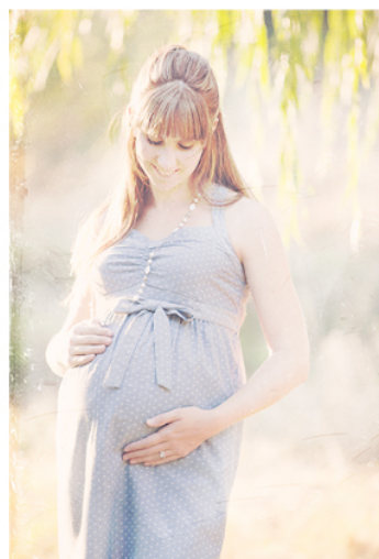
ORIGINAL PHOTO WITH TEXTURES 06-6 SET TO OVERLAY