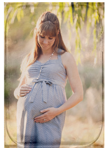
ORIGINAL PHOTO WITH TEXTURES 05-7 SET TO LINEAR BURN