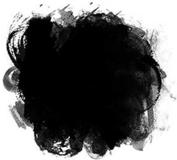
Purchased shape (Mask) included in "Window Masks" product.